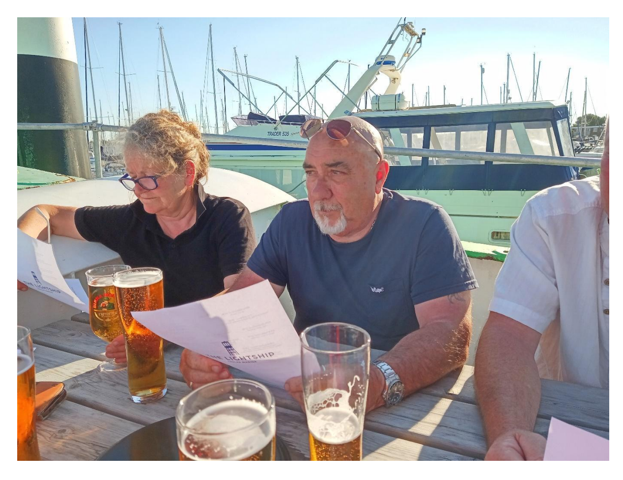
Enjoying dinner on the Lightship