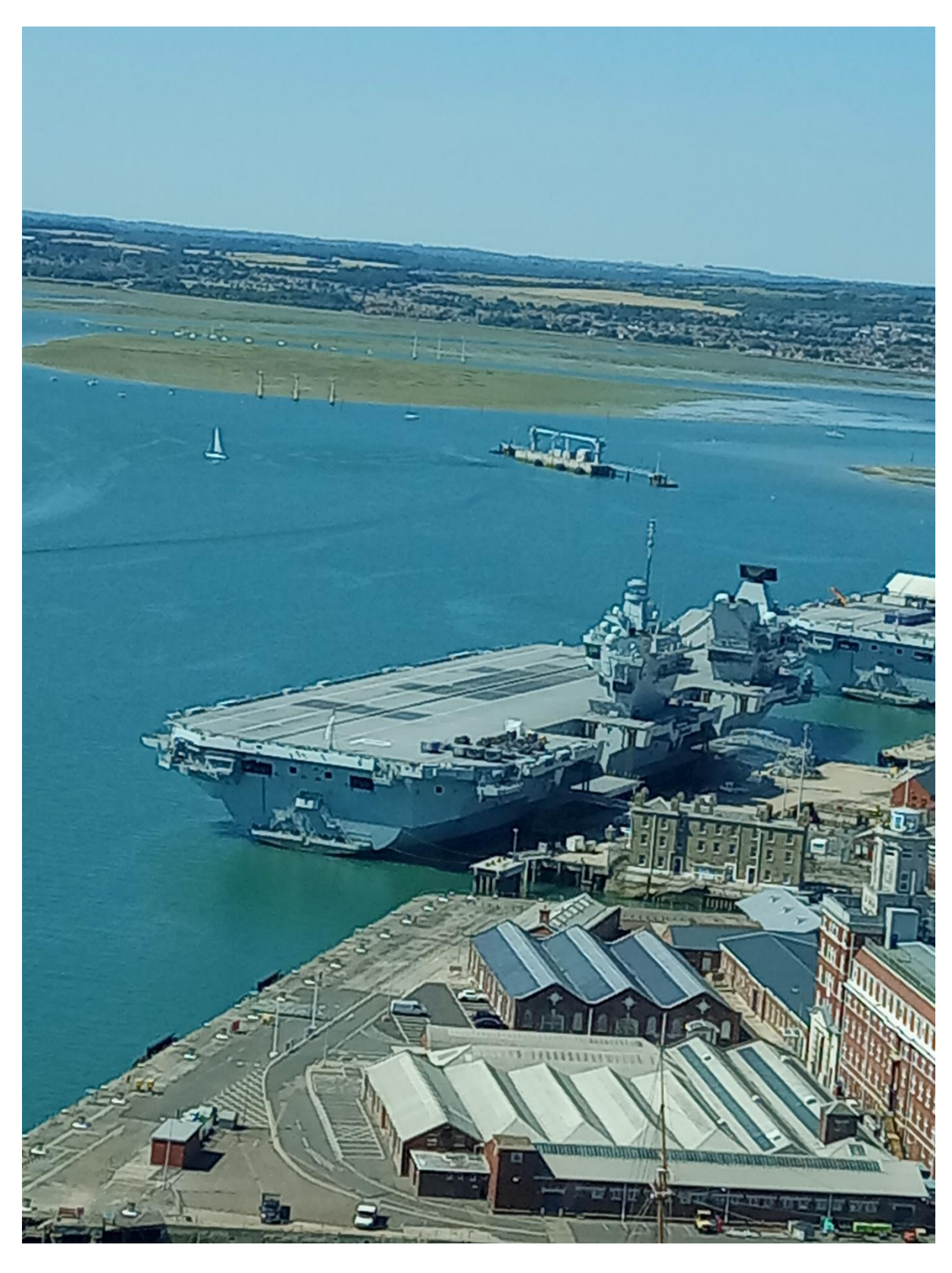
Great views from the top!