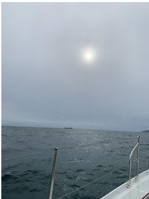
14. Under a Milky Sun

Skipper enjoying fine conditions under milky Sun!