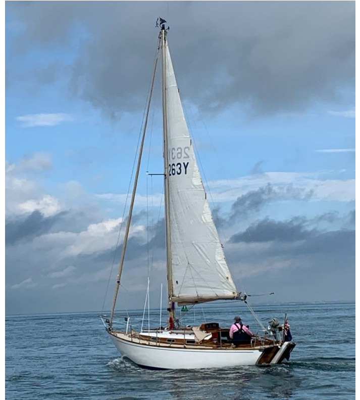
5. Twister En-route to Portland off Totland Early AM

Day 3: Monday 17 th good forecast (SW 3-4/5)