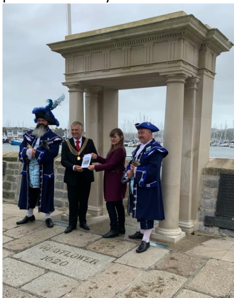
15. Plymouth Dignitaries

DAY 11 Tuesday Aug 25 th : Plymouth presentation day.