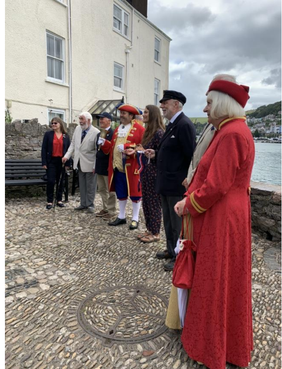
9. Dartmouth Dignitaries Assembled

DAY 9 Sunday 23 AUG: M400 rally presentation Day (DARTMOUTH)