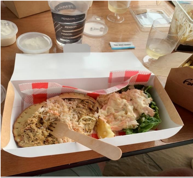
3. The Start of the Foodie Cruise

Day 1: Sat 15 th Aug Boats assembled at Cowes Yacht Haven. Crab and salad supper at the HAVEN.