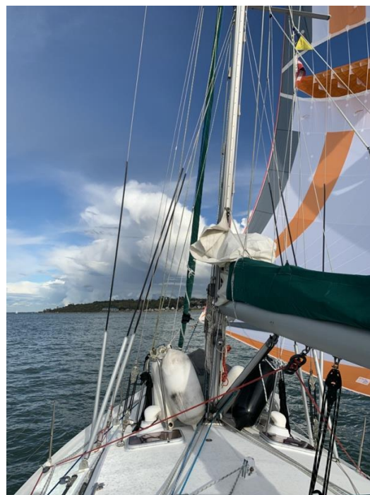
19. Cowes in Sight