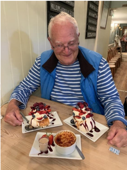
4. Mikey's Diet Goes West

Day 2: Sun 16 th Gentle cruise down to Yarmouth (pm) followed by excellent meal at "On The Rocks"