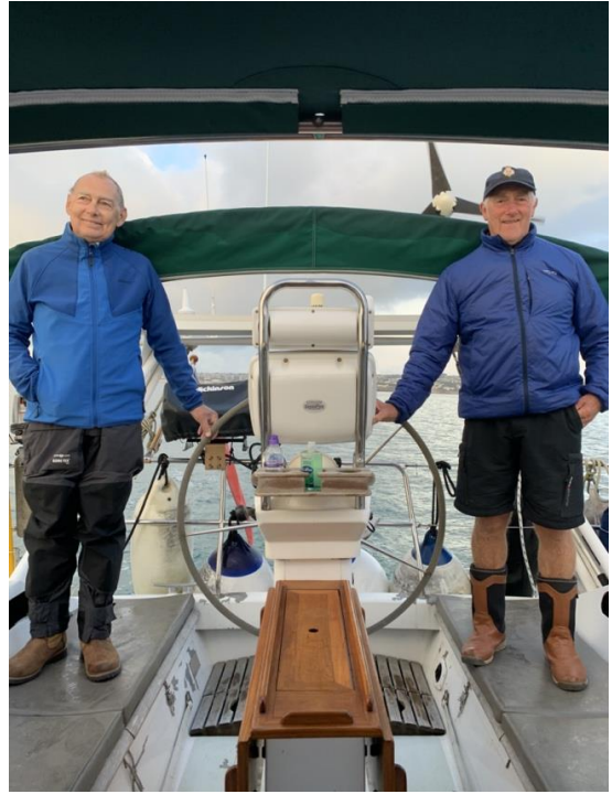
2. The Motley Crew

ORGANISERS of M400 Rally 2020: ROYAL SOUTHAMPTON YACHT CLUB and ROYAL NAVY VOLUNTEER RESERVE YACHT CLUB