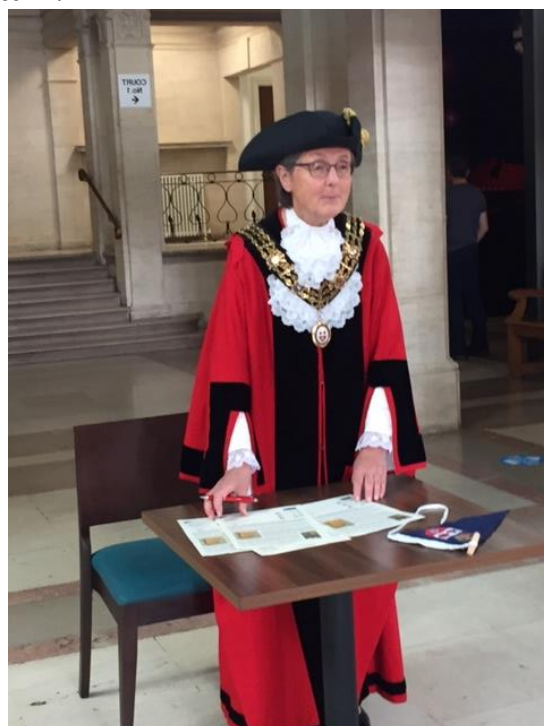
20. Final Ceremony

PS Saturday am, Nyda was refuelled, and returned to her mooring up river, followed by a very wet trip back to ECSC in the dinghy (Wind against tide in Medina!) tide out at ECSC muddy return!