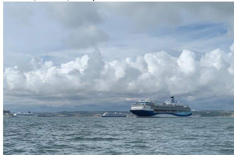
6. Cruise Liners Anchored in Weymouth Bay

Left Yarmouth calm sea, spot of fishing (0), wind picked up, and sailing closed hauled at about 5/6 knots, sunny.